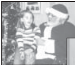
For the young ...