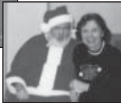
& young at heart.

Food aplenty, hot chocolate, a bon fire, caroling, sleigh bells, lighted tree, Santa, Ms. Santa, and elves - yep, it must be Christmas!